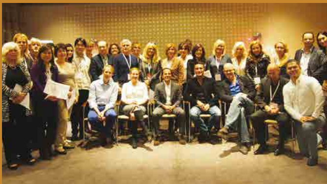
CFA Amsterdam, 10-11 October 2014