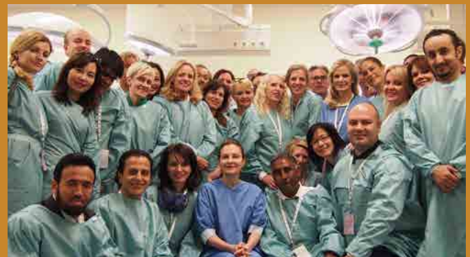
CFA Amsterdam, (Spring session) 8-9 May 2015