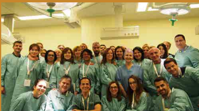
CFA Amsterdam, (Winter session) 27-28 November 2015