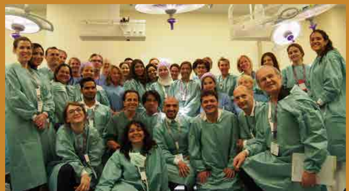
CFA Amsterdam, (Spring session) 13-14 May 2016